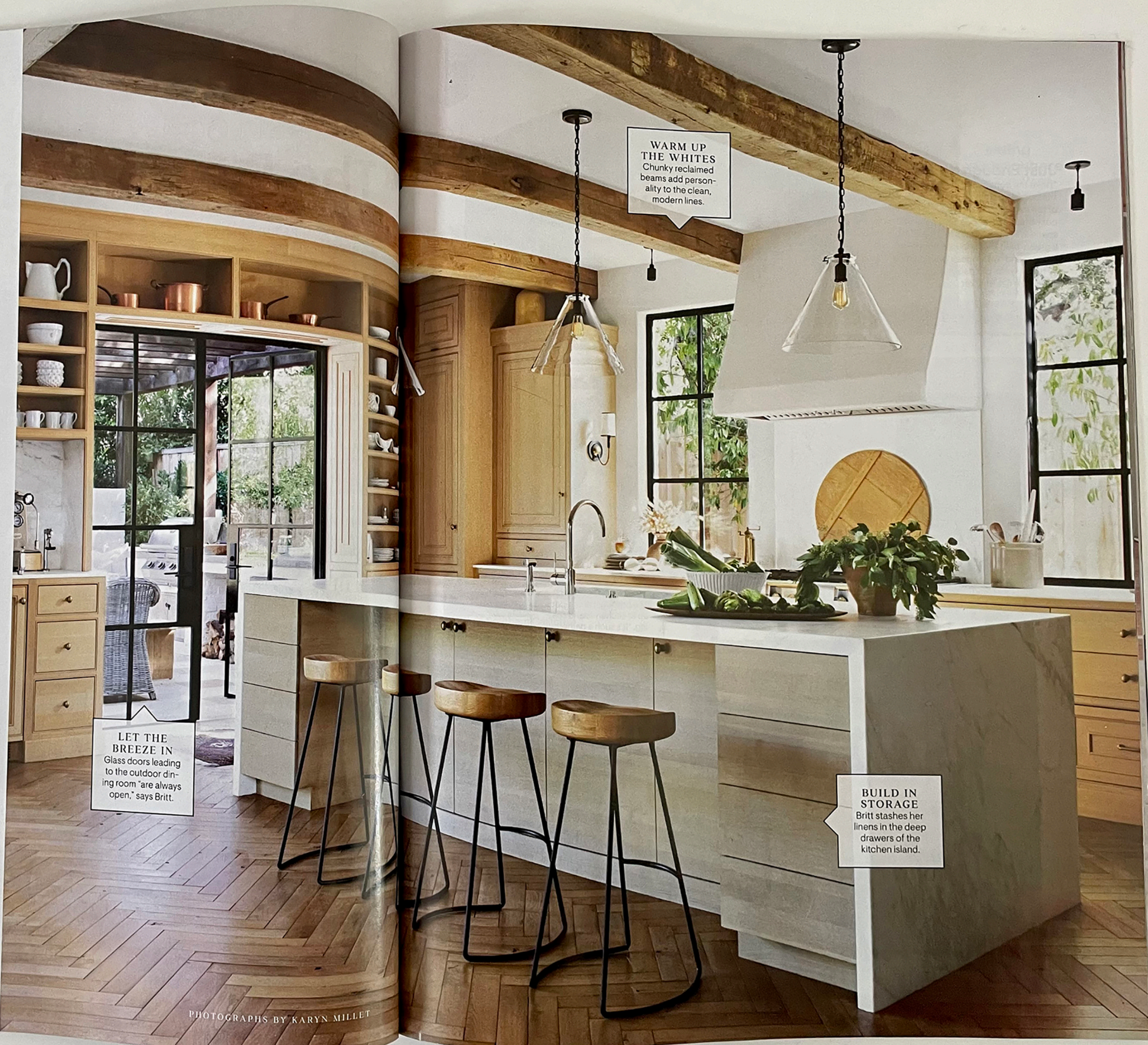
WARM UP THE WHITES Chunky reclaimed beams add personality to the clean, modern lines.